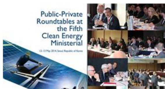
Public-Private Roundtables at the Fifth Clean Energy Ministerial