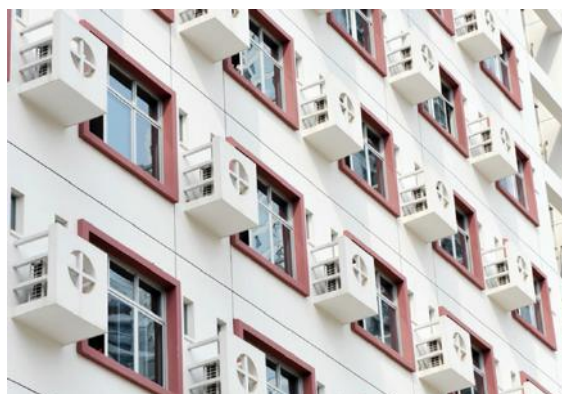
Industry Commits to Development