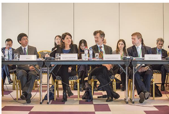
Delegates Prepare For the Eighth